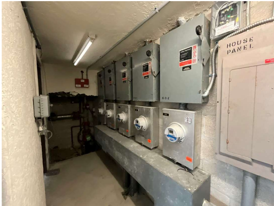
6. View of the typical panels and switches.