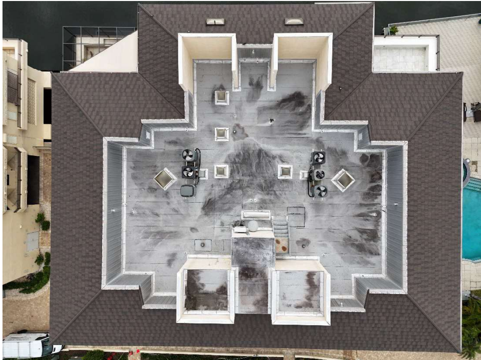
2. Overview of the typical roofing system.