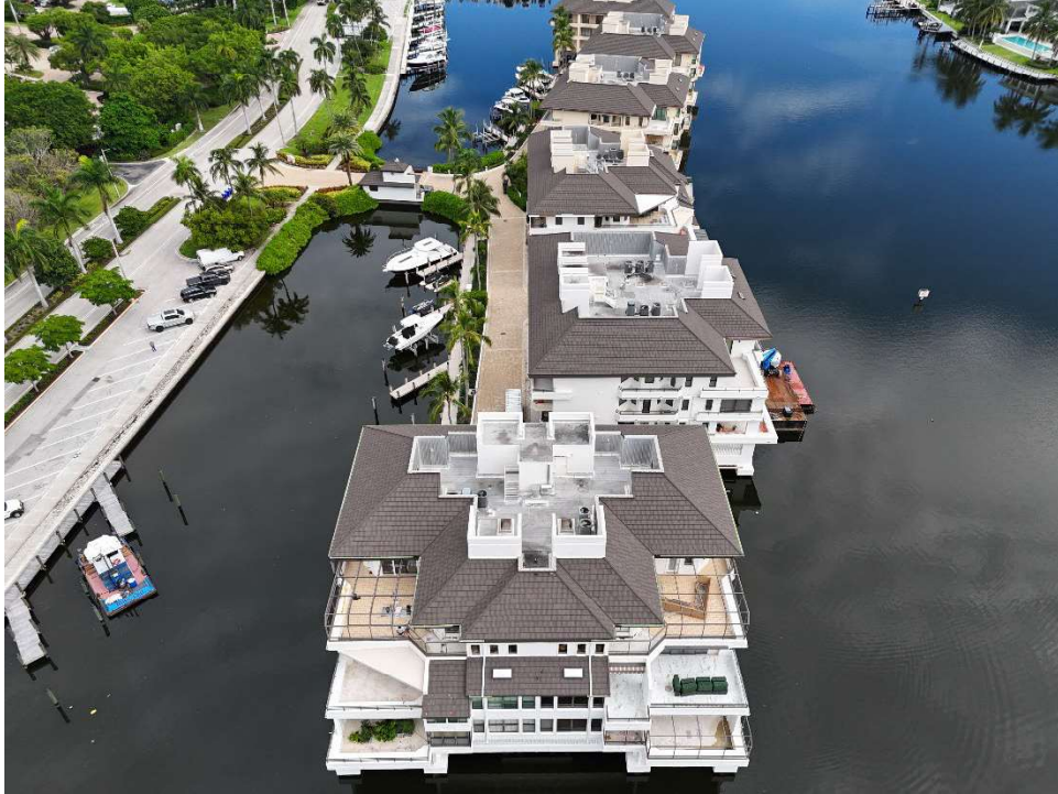
1. View of the subject association buildings.