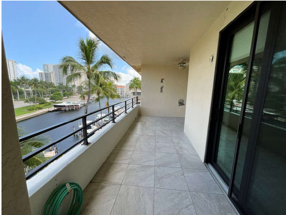
4. View of a typical balcony.