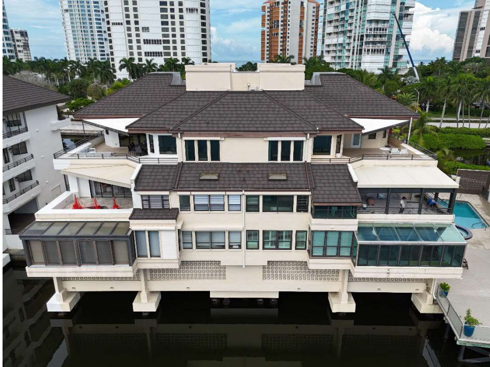
3. View of the typical rear elevation.